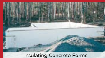
Insulating Concrete Forms